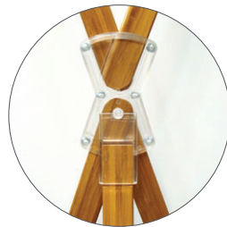
Strong yet lightweight X-Brace ensures stability with beauty