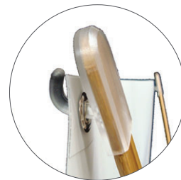
All banners have strong metal grommets to ensure durability