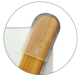
Beauty with strength...the flexibility of bamboo, with the beauty of simplicity