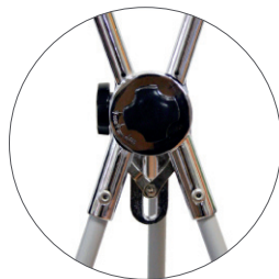
ECON's Adjustable X-Brace system

The ECON Waterbase, provides extra stability for outdoor use while remaining portable.