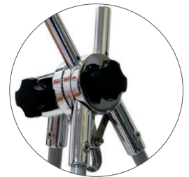
Fits banners of various sizes