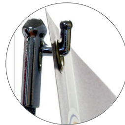
Hook the top