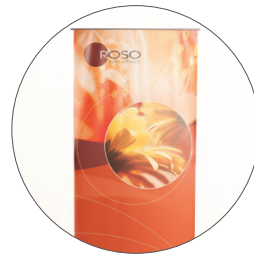
Sturdy Stands alone with durable, high-impact graphic