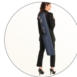
Convenient Retractable and lightweight for ease and portability